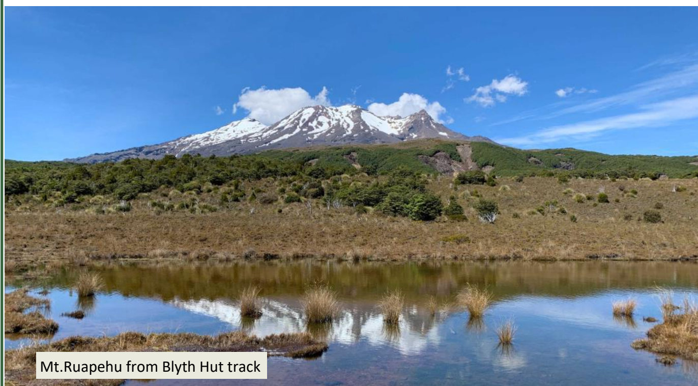
Mt. Ruapehu from Blyth Hut track

We were rewarded with a stunning view of Mt Ruapehu.