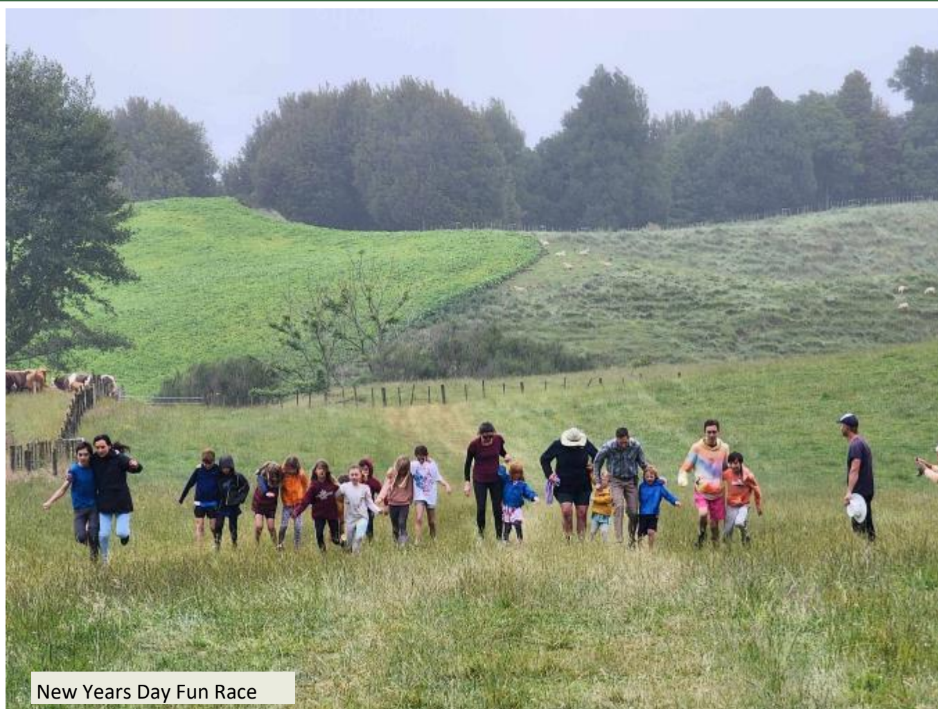
New Years Day Fun Race