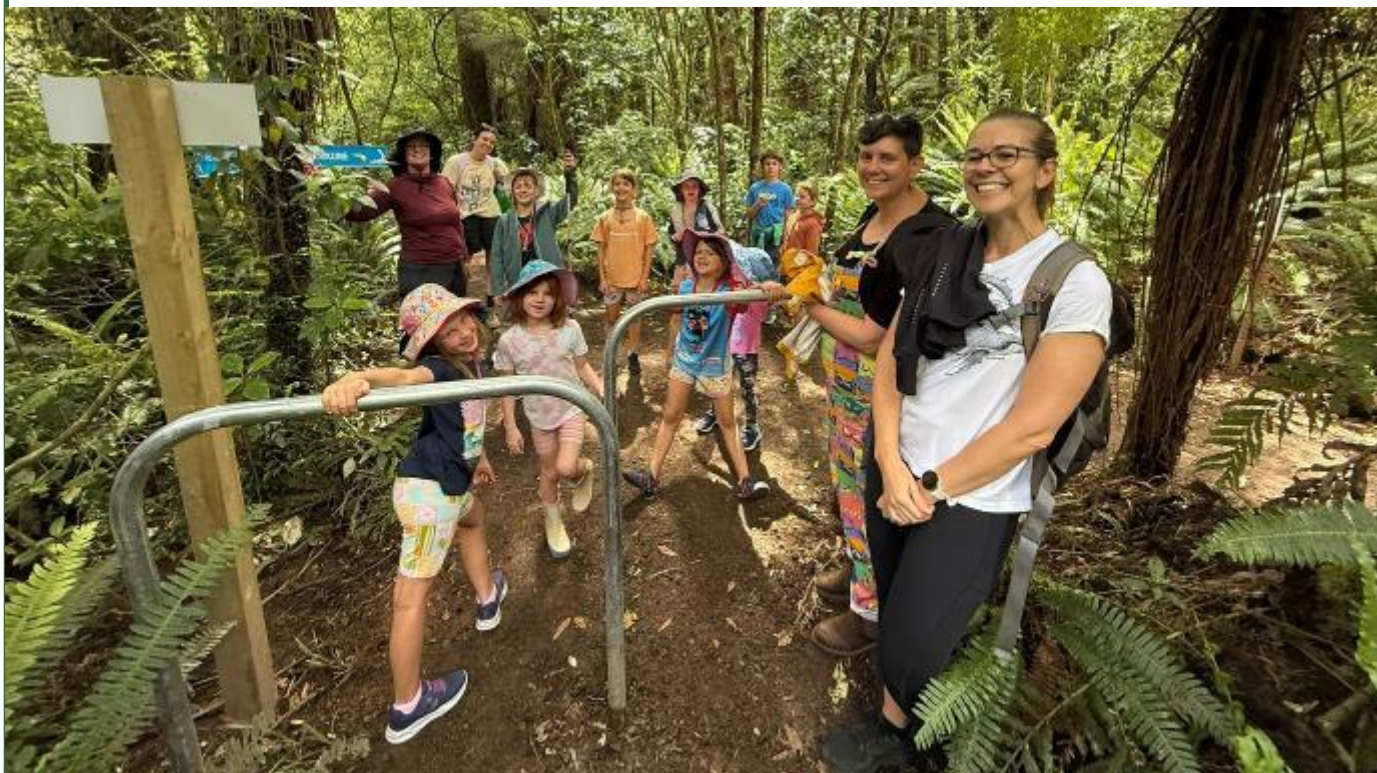
Mangawhero Forest Walk.

ASC campers are a determined bunch, though, and a pub lunch the following day proved to be an excellent 'Plan B' until the rain eased enough for bush exploration along the beautiful Mangawhero Forest Walk.