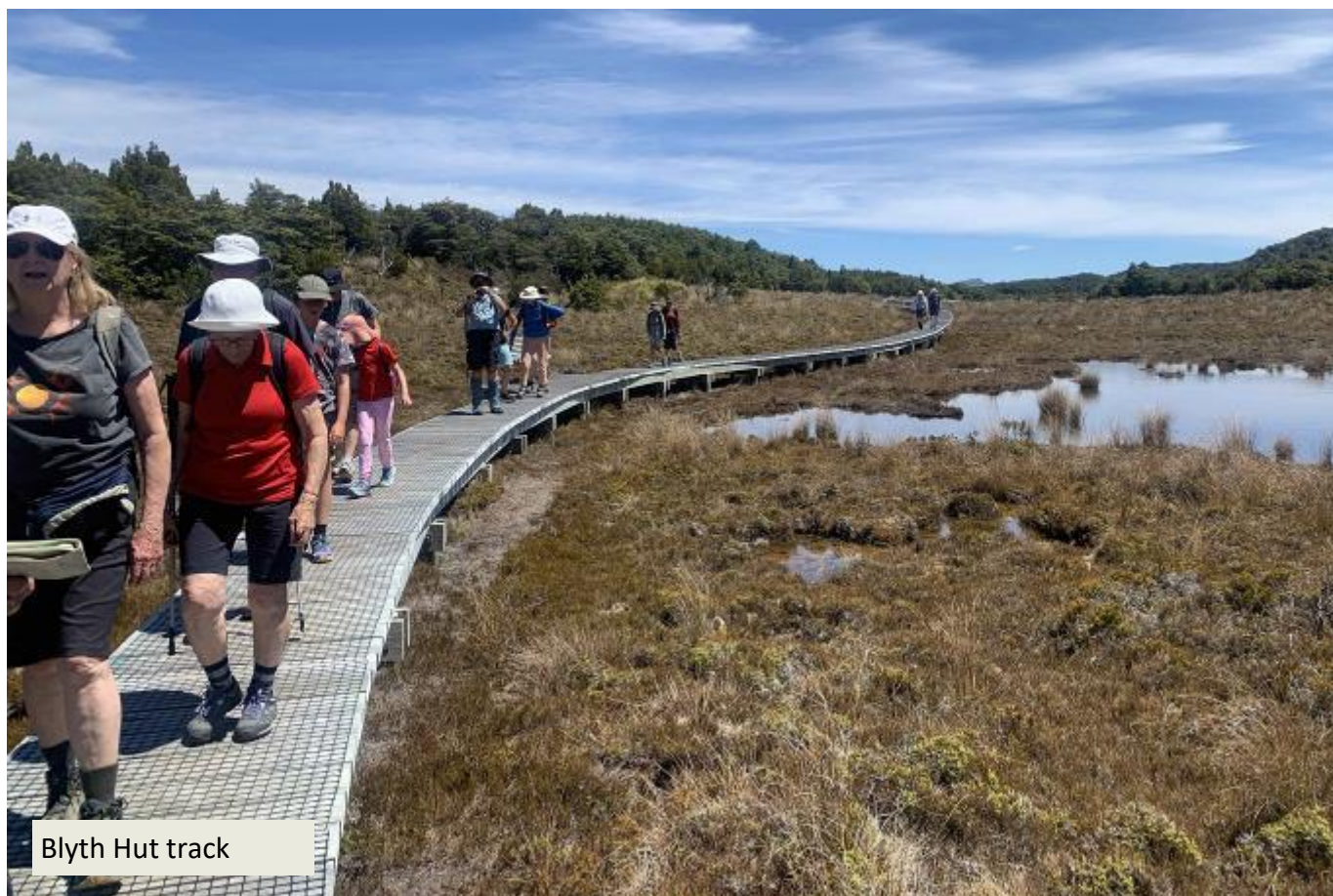
Blyth Hut track

While the weather wasn't kind to us much of the time, we had one fabulous day when 30 of our members set out from the Ohakune Mountain Road on a 1 1/2 hour walk to Blyth Hut, passing the Waitonga Falls and mountain tarns on the way.