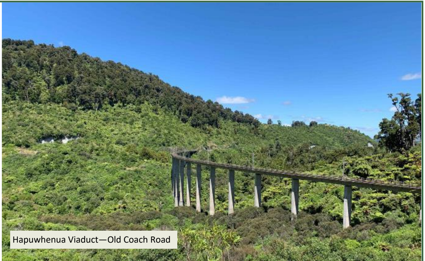
Hapuwhenua Viaduct—Old Coach Road

The historic Hapuwhenua Viaduct is a highlight of the Old Coach Road section of the Mountains to Sea - Nga Ara Tuhono - bike trail and walking track.