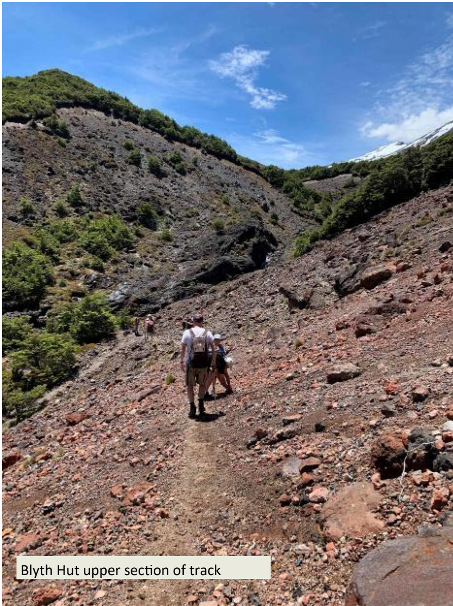
Blyth Hut upper section of track

The upper section of the track was a little tricky.