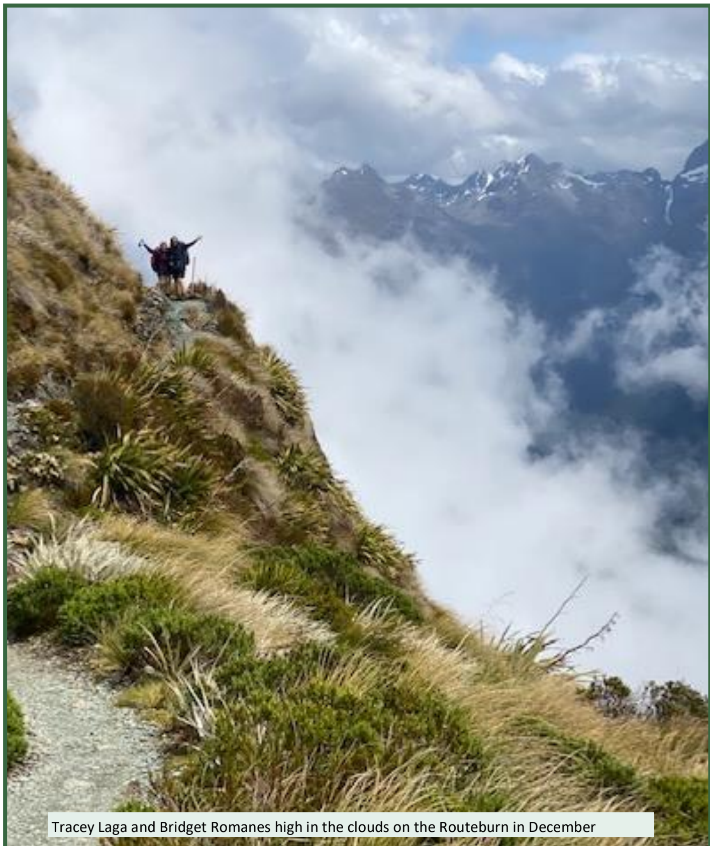
Tracey Laga and Bridget Romanes high in the clouds on the Routeburn in December